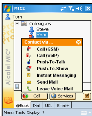
Figure 1: Dynamic Address Book

The user accesses his/her services thanks to a Dynamic Address Book, the unique user entry point to IMS services. The Dynamic Address Book automatically synchronizes itself with the network, ensuring that data is never lost. It provides presence information for a user-defined subset of contacts, including contact status, device type, and service availability. The user is directed to the most convenient way to reach a given contact, thanks to a presence-based dynamic service menu.