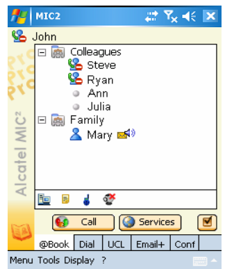
Figure 6: John is notified that Mary has left him a voice mail

John will listen to Mary's voice mail once the conference is over.